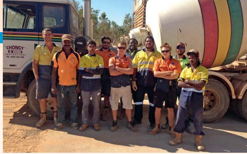
Hutchies' Doomadgee team.

These four indigenous trainees have since found employment