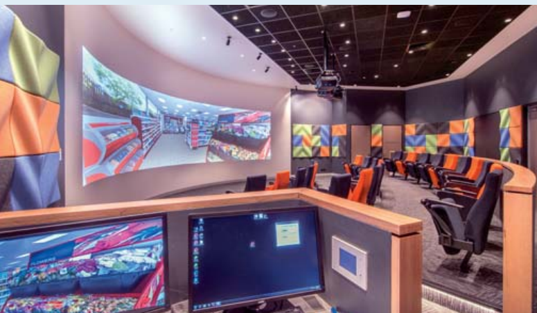
A new Innovation Centre has been completed for Mondelez.