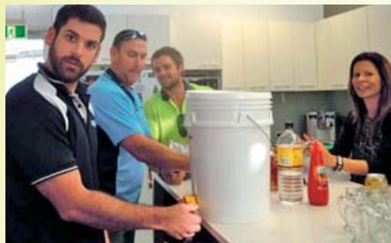
LEFT: Hutchies' Townsville team members bottling their latest supply of honey.

"The last raid we took nearly 70 kg from the two boxes on top which was exceptional. Normally we get around 15 to 20 kg per box," said Matt.