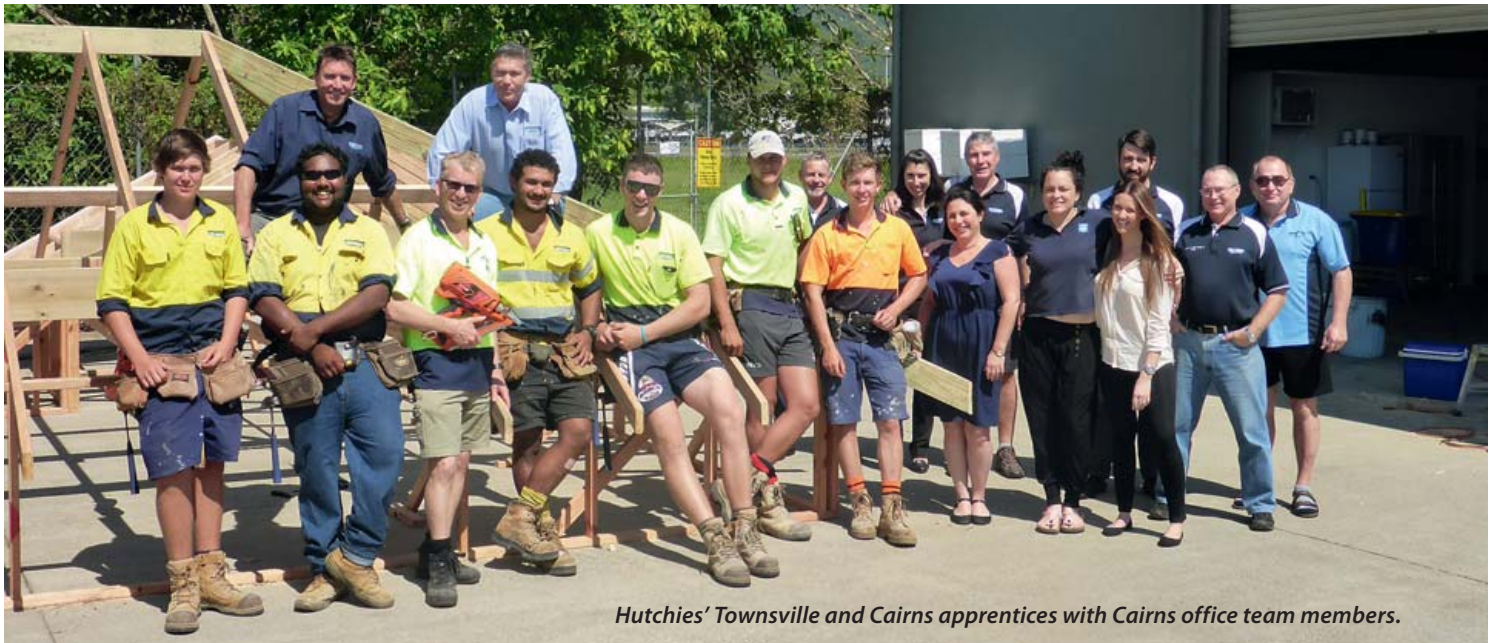
Hutchies' Townsville and Cairns apprentices with Cairns office team members.

CAIRNS and Townsville enjoy friendly rivalry but recently Hutchies' apprentices from Cairns and Townsville had a serious get together to gain some valuable pitched roof training at the Cairns office.