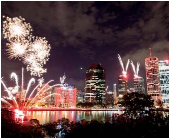
Spectacular fiery finish to the 2014 Apprentice of the Year Award function.