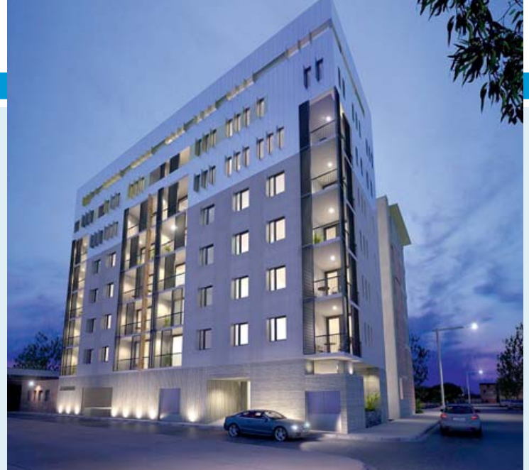
Echo apartments in South Yarra – construction starting soon.