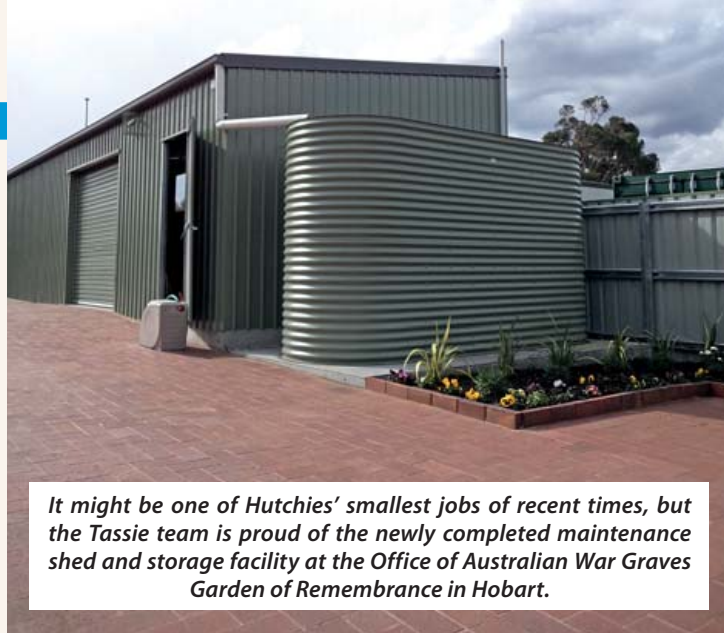
It might be one of Hutchies' smallest jobs of recent times, but the Tassie team is proud of the newly completed maintenance shed and storage facility at the Office of Australian War Graves Garden of Remembrance in Hobart.

"We are now considered 'locals' on a national scale because our team members and their fami-