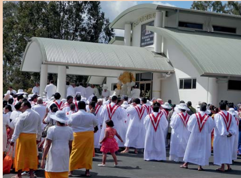
The official opening of the Logan Samoan Methodist Church was an inspiring experience, with 400 guests from all over the world rejoicing in the occasion.

Hutchies was an event partner and crewed aboard yacht, The Matrix .