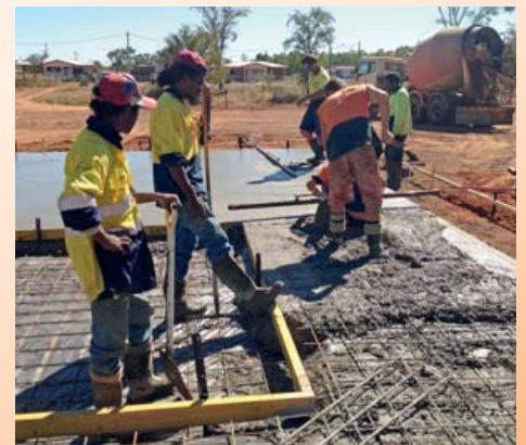
House slab pour at Doomadgee.