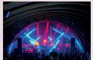
The Triffid, created as a new inner city space where bands love to play and audiences love to be, opened in November.

The ribbed, curved roof has been specially treated so it looks good and sounds great but is sound-proofed to be neighbour-friendly.