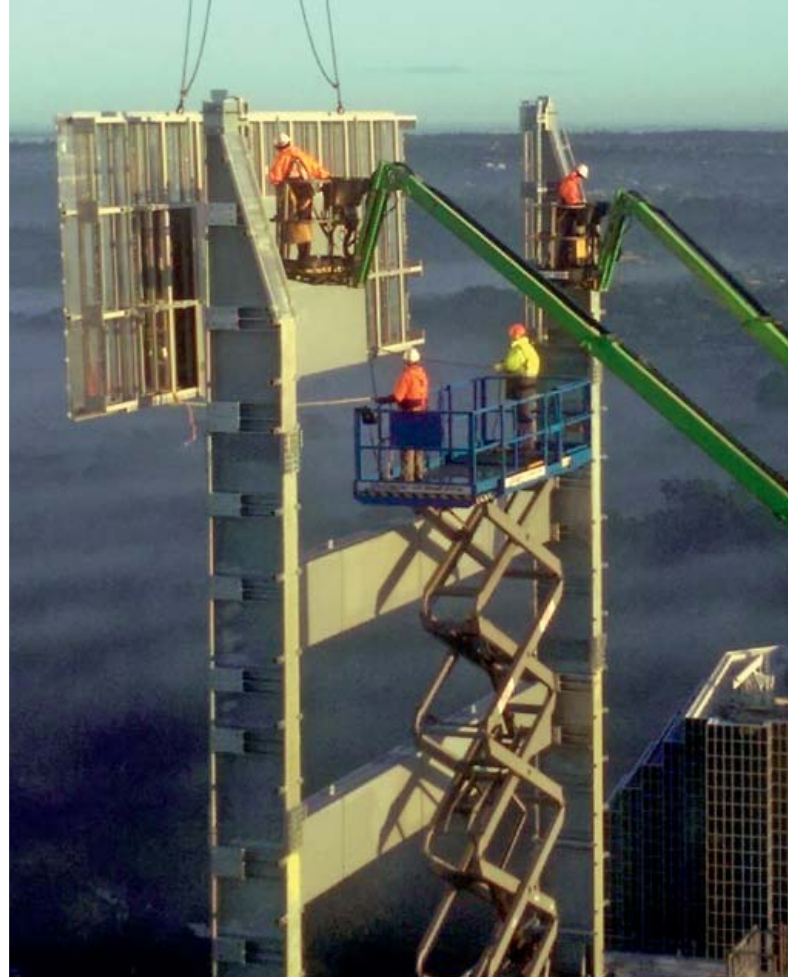
Metro Grand is among the tallest buildings on Sydney's skyline.