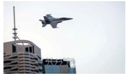
Aerial salute to Hutchies' young achievers.

The grand finale to the Apprentice of the Year Award included a RAAF flypast and a spectacular fireworks show at huge expense ... not for Hutchies, but for the organisers of River Fire!