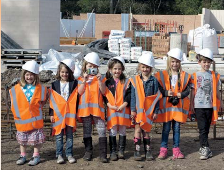
Future students looked the part when they toured the site of their new school.