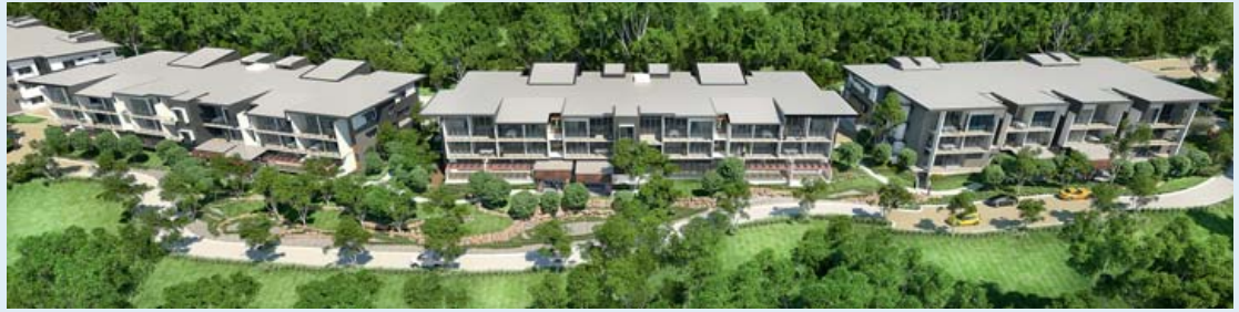
Stages one and two of the Canopy development are under construction.

Job Description: This project is located within the busy retail and restaurant area of South Bank, Brisbane.