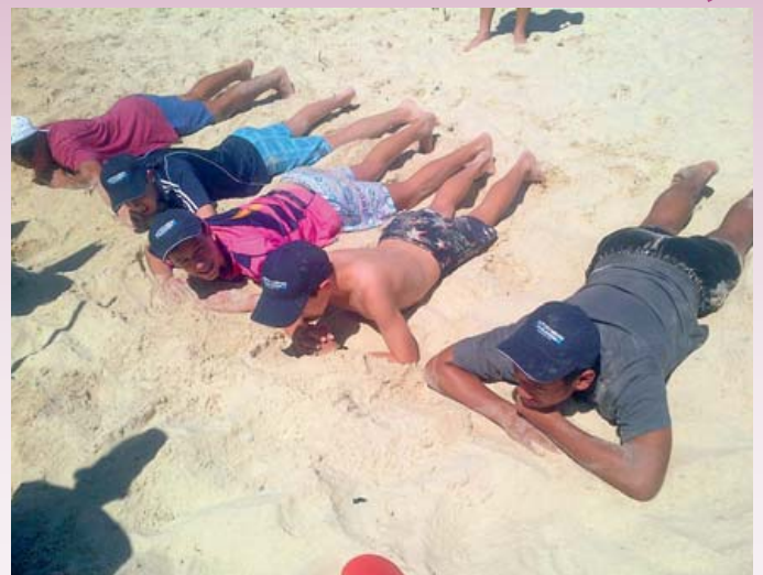
Beach flag heat at the Terrace Year 8 Father and Son Camp on North Stradbroke Island.