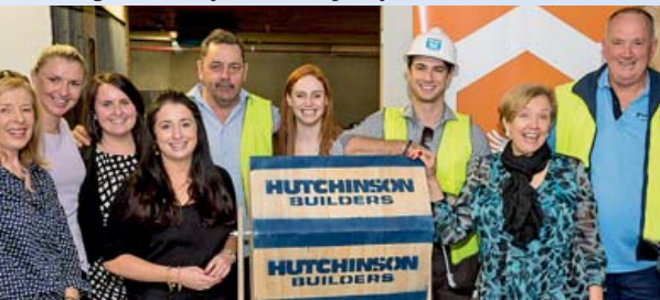
PIF and Hutchies team members draw the winning raffle ticket.

Another six classrooms also are being built.