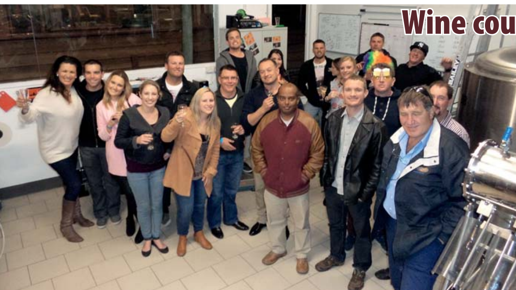
Hutchies' Toowoomba team members adding to their encyclopaedic knowledge of beer.