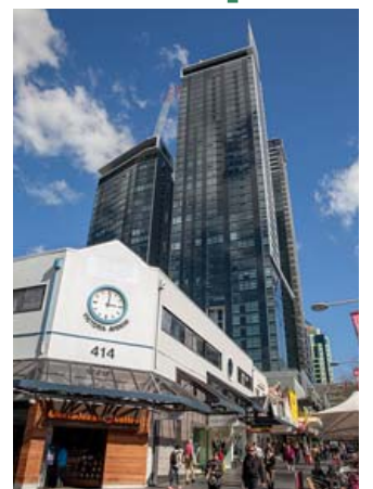
Hutchies' largest project to date, the $230 million Metro Residences, is now complete.

The $230 million three-tower Metro Residences – 553 apartments covering 110 floors across three individual towers and built over the Chatswood Transport Interchange – is Hutchies' largest project in Australia.