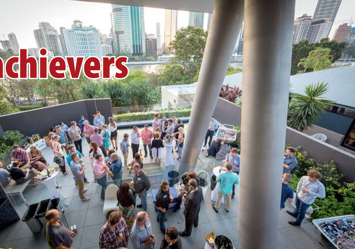
Guests mingle and chat during the award function.