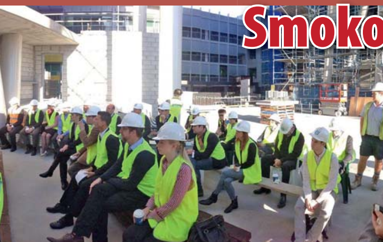
Guests attending Hutchies' first Smoko.

HUTCHIES has introduced a new form of 'smoko' to allow outsiders to visit live construction sites and learn more about the construction process.