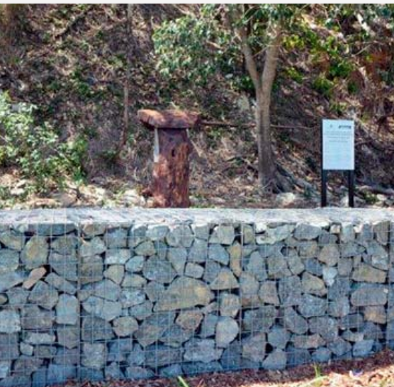
Swish new native bee penthouse hive was a D & C project built by Hutchies' Gladstone Foreshore team from a hollow log on a concrete base.