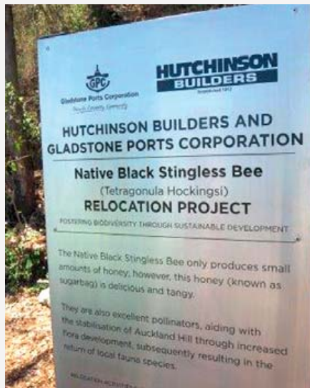
The hive signage provided by client, GPC, will ensure Hutchies' environmental stance and love of bees has a long legacy in the Gladstone community.

This hive will assist in the stabilisation of Auckland Hill through increased flora development.