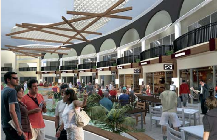
Artist's impression of the facade and shopfront upgrade to the central shopping and dining plaza of Chevron Renaissance in the heart of Surfers Paradise – one of Hutchies' smaller jobs on its varied workbook.

HUTCHIES has always done small jobs and bid open tenders – we follow the client rather than size or category of the project.