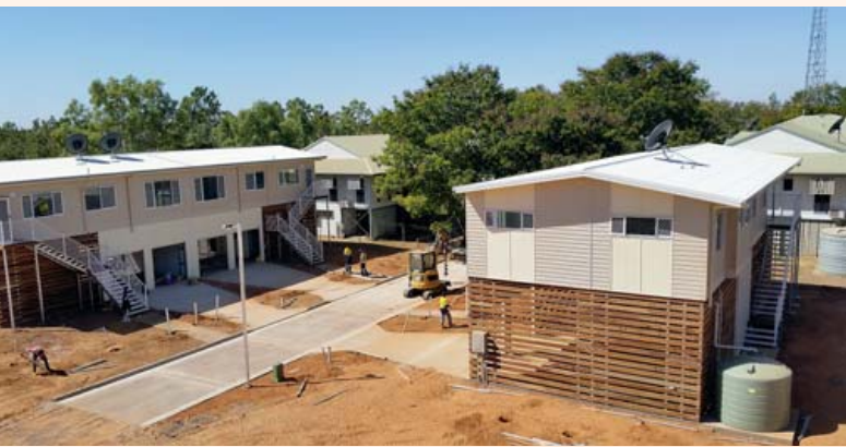
New residences at Doomadgee.